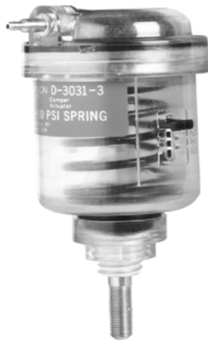
D-3031 Pneumatic Piston Damper Actuator

The D-3031 is a sealed unit. If the D-3031 Pneumatic Piston Damper Actuator fails to operate within its specifications, replace the unit. For a replacement actuator, contact the nearest Johnson Controls® representative.