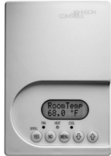
T600xxx-3 Series Thermostats