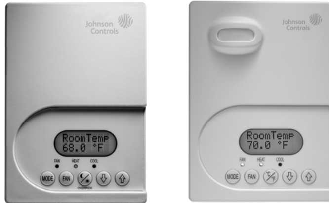
T60xDFH-3 and T60xDFH-3+PIR Series Thermostat Controllers with Dehumidification and Occupancy Sensing Capability

Refer to the T60xDFH-3 and T60xDFH-3+PIR Thermostat Controllers with Dehumidification and Occupancy Sensing Capability Product Bulletin (LIT-12011275) for important product application information.