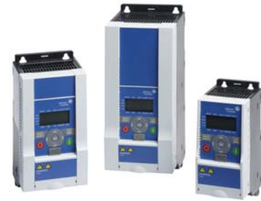
VSD Series II Variable Speed Micro Drive