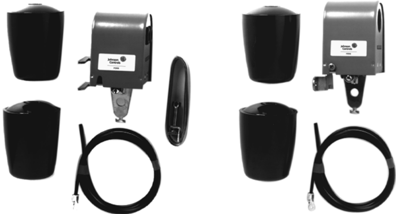
F59A-2 Sump Pump Switch