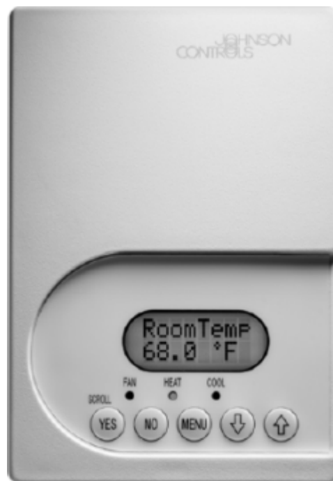
Figure 1: T600xxx-3 Series Thermostat

The T600xxx-3 Series thermostats include several models: Single-stage (T600HCx-3), Heat Pump (T600HPx-3), Multi-stage (T600MSx-3), and Economizer (T600MEP-3). All thermostats use a unique Proportional-Integral (PI) proportional control algorithm that virtually eliminates temperature offset associated with traditional differential based thermostats.