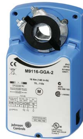
M9116 Series Electric Non-Spring-Return Actuators

An anti-rotation bracket prevents lateral movement of the actuator. Pressing the spring-loaded gear release on the actuator