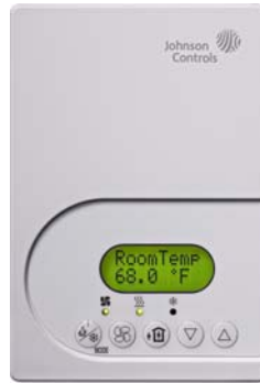
TEC21x6-4 Series Thermostat Controller

Refer to the TEC21x6(H)-4 and TEC21x6H-4+PIR Series N2 Networked Thermostat Controllers with Dehumidification Capability, Fan Control, and Occupancy Sensing Capability Product Bulletin (LIT-12011601) for important product application information.