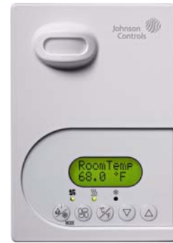
TEC21x6H-4+PIR Series Thermostat Controller