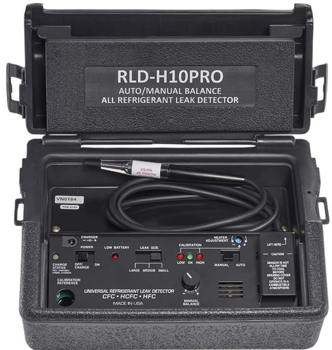
Figure 1: RLD-H10PRO Refrigerant Leak Detector

The RLD-H10PRO is intended principally as a service technician's tool. This detector has the capability to detect small amounts of halogenated gases, including chlorine and fluorine-based refrigerants and blends.