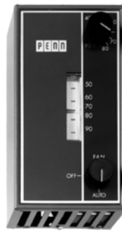
T22 Series Line Voltage Wall Thermostat