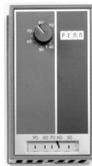
T25 Series Line Voltage Wall Thermostat