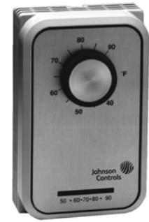
T25 Series Line Voltage Wall Thermostat